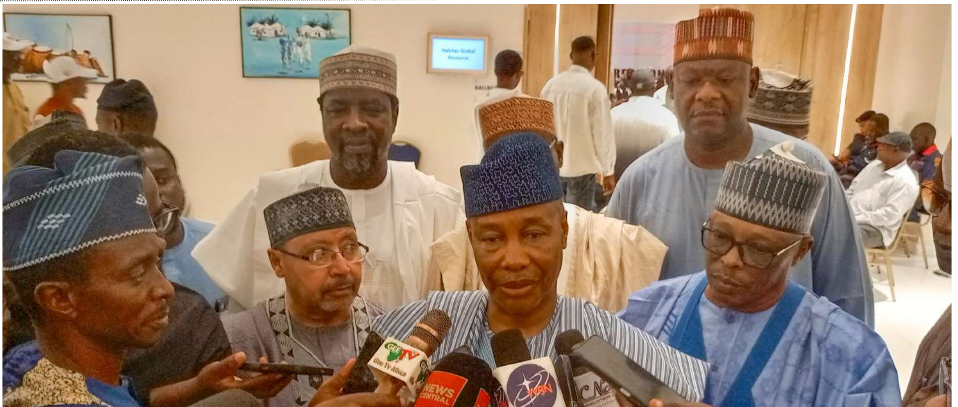
Former Inspector General of Police/Gubernatorial aspirant of Yobe state, Usman Alkali Baba, addressing journalists, after his submission of expression of interest and nomination forms, yesterday in Abuja.

Concluding his message, Ayade urged patience and faith among his followers, expressing hope that the President would ultimately reconsider the decision. He described the situation as a test of restraint and conviction, insisting that their collective future remains bright despite the current setback.