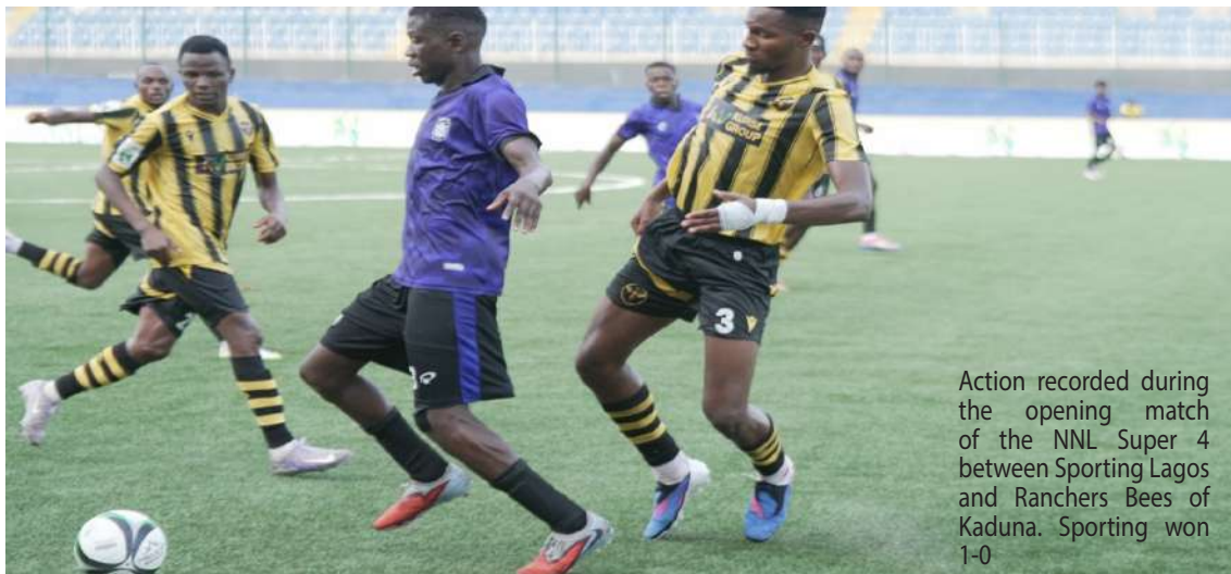
Action recorded during the opening match of the NNL Super 4 between Sporting Lagos and Ranchers Bees of Kaduna. Sporting won 1-0