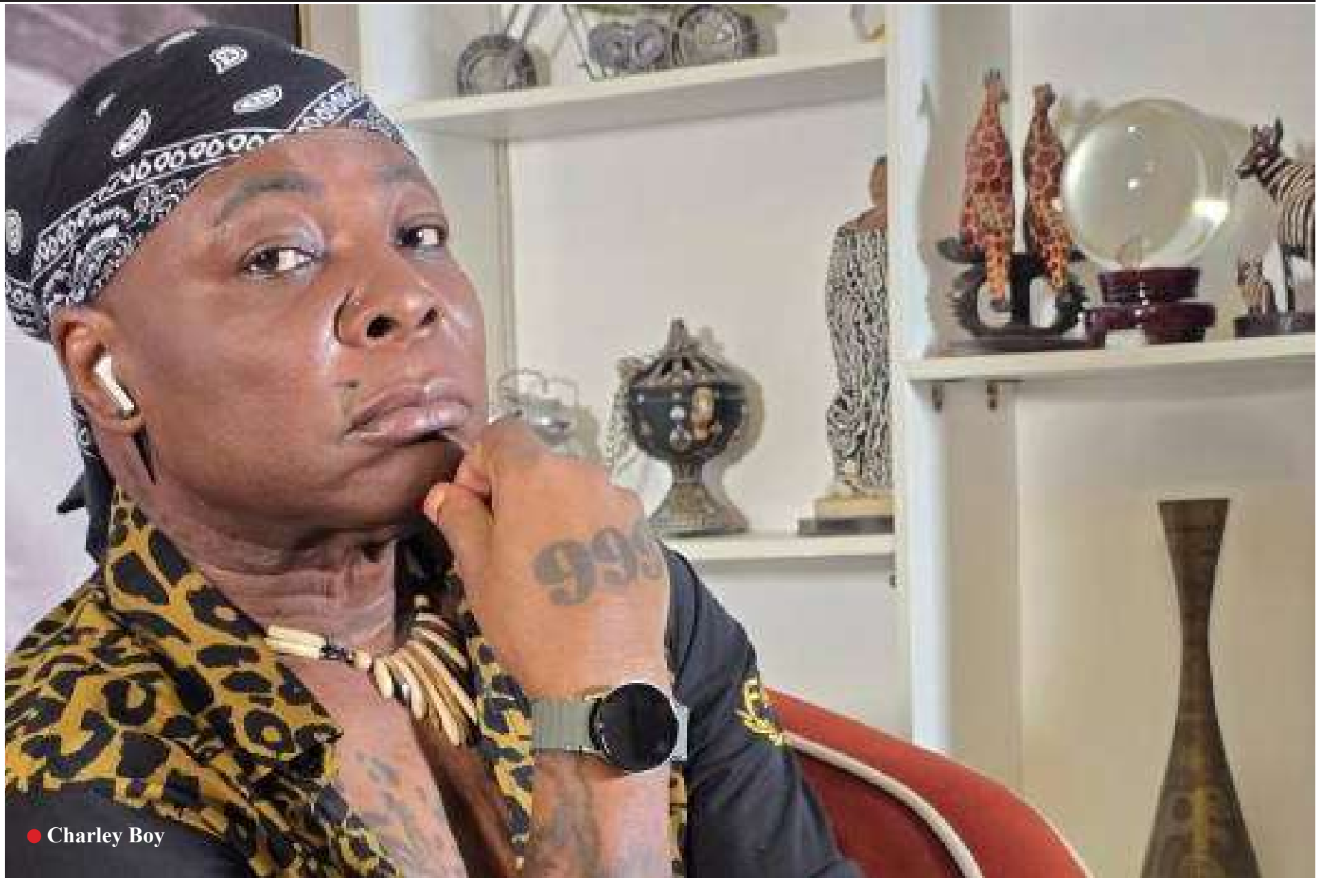
● Charley Boy